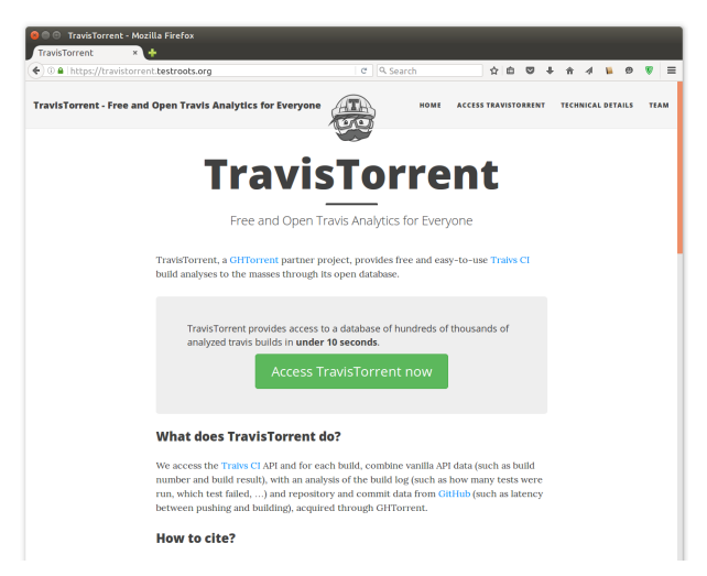
Figure 1: TRAVISTORRENT (http://travistorrent.testroots.org) on July, 20th, 2016.

TravisPoker. To find out which and how many projects on GitHub use TRAVIS CI, we implemented TRAVISPOKER. This fast and lightweight application takes a GITHUB project name as input (for